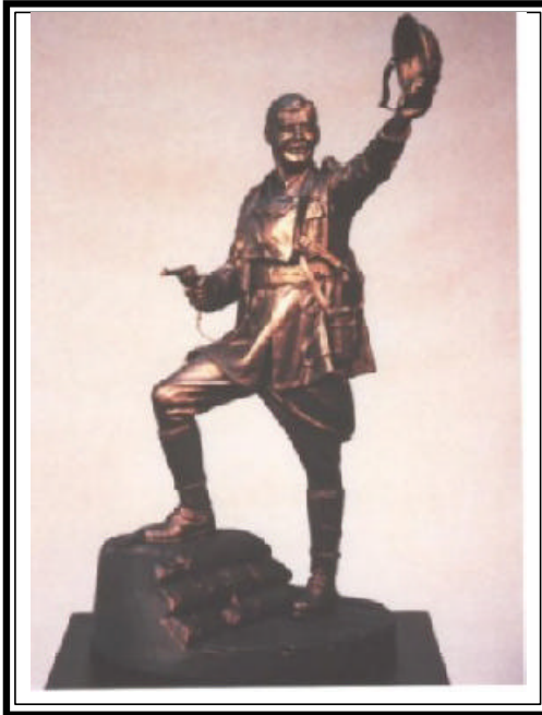
The Vimy Award/La Distinction honorifique Vimy

For more information, including ticket orders for the Award dinner, contact the Conference of Defence Associations Institute at: Fax (613) 236 8191; e-mail: pao@cda-cdai.ca ; or telephone (613) 236 9903.